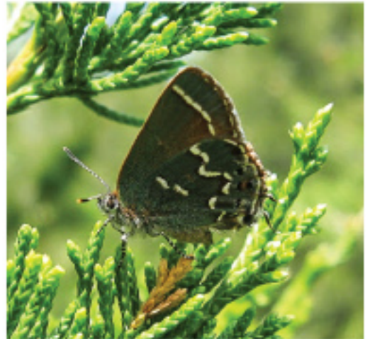
Host Plant of Juniper Hairstreak Butterfly